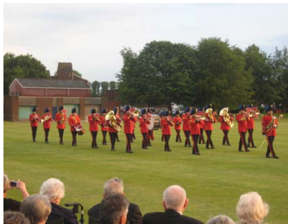
The Corps Band Beat Retreat

A sad occasion and in many ways an honour to be involved in the organisation of this auspicious event even if it did involve turning back the clock and attending, once more, pre-move meetings with that feeling that one had never gone into retirement sixteen years ago.