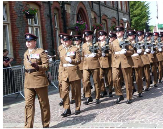
The RSM leads the Regiment into the Market Place for the Freedom Parade.