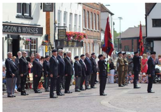
The 'veterans' on the Freedom Parade