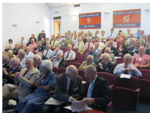
The 'Maps and Surveys' Seminar