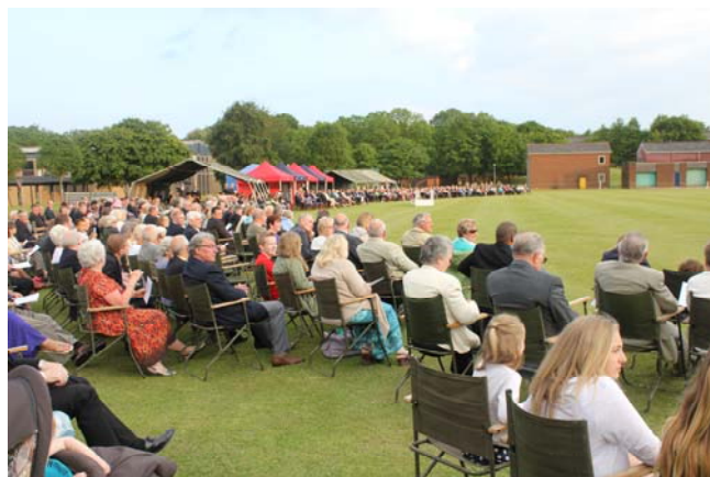
Crowds enjoying the Beat Retreat